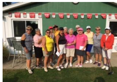
2017 Fall Interclub Classic Participants